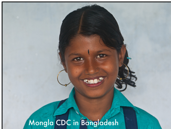
Mongla CDC in Bangladesh

Child Development Centers (CDCs) meet the physical, spiritual, and educational needs of children. The goal of CDCs is to transform young lives into healthy Christ followers. CDCs are ministry centers serving entire communities and are used for community-based health care, shelters during times of natural disasters, and leadership training centers.