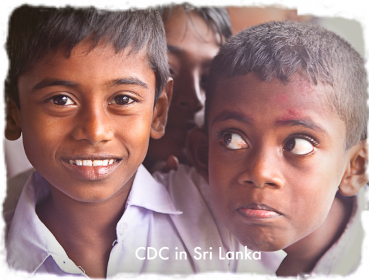
CDC in Sri Lanka