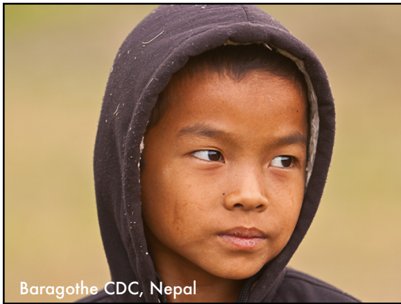
Baragothe CDC, Nepal

“Speak up for those who can’t speak for themselves. Speak up for the rights of all those who are poor” (Prov. 31:8, NIRV).