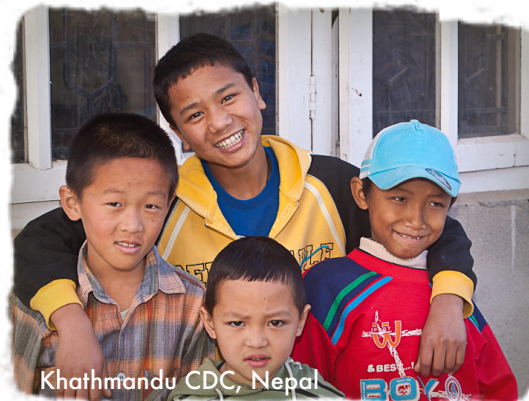
Khathmandu CDC, Nepal