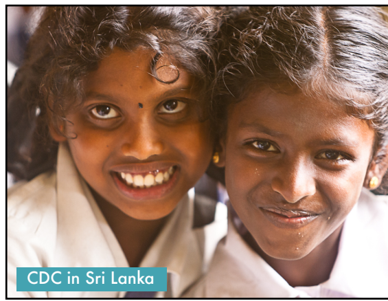
CDC in Sri Lanka