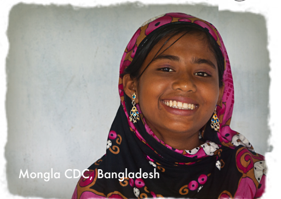
Mongla CDC, Bangladesh

YOUR INVESTMENT OF $132 WILL SPONSOR A CHILD FOR A YEAR. THE CHILDREN OF SOUTH ASIA ARE WORTH THE SACRIFICE.