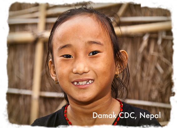
Damak CDC, Nepal

COMPASSION 575 -partnering with Nazarene Compassionate Ministries (NCM)-South Asia