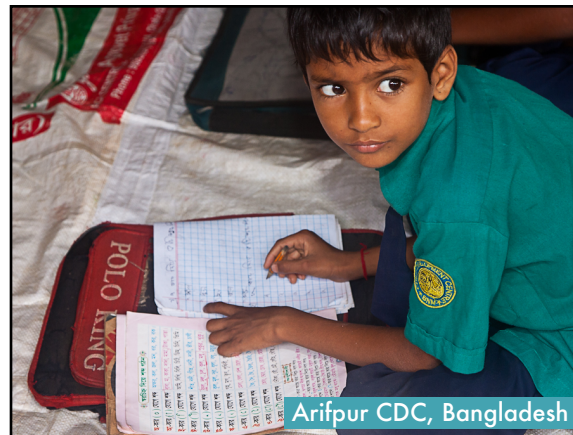
Arifpur CDC, Bangladesh

Secure online giving is available at: www.compassion575.com