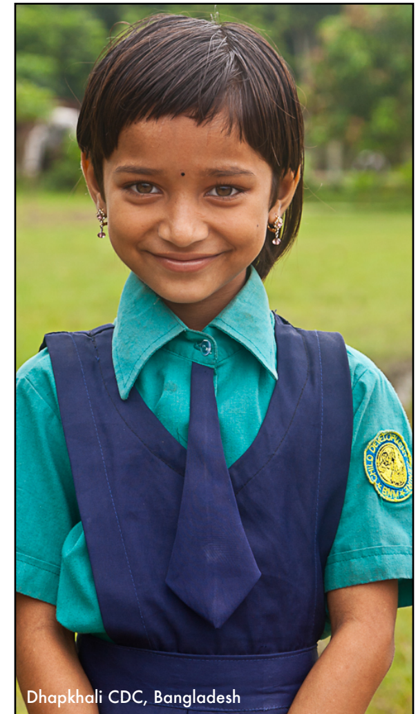
Dhaphkali CDC, Bangladesh