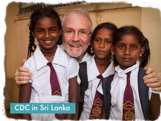
CDC in Sri Lanka