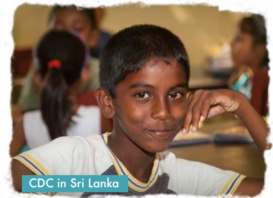
CDC in Sri Lanka

YOUR INVESTMENT OF $132 WILL SPONSOR A CHILD FOR A YEAR. THE CHILDREN OF SOUTH ASIA ARE WORTH THE SACRIFICE.