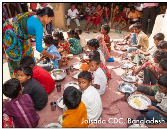
Jaisada CDC, Bangladesh