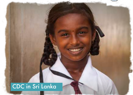
CDC in Sri Lanka