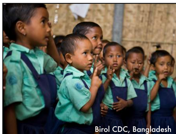
Birol CDC, Bangladesh