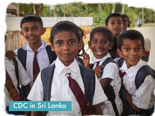
CDC in Sri Lanka

We have priority needs in Sri Lanka. Please pray for matching funds to begin the 2015 campaign for significant investments in the children of Sri Lanka.