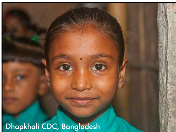
Dhaphkali CDC, Bangladesh

Secure online giving is available at: www.compassion575.com