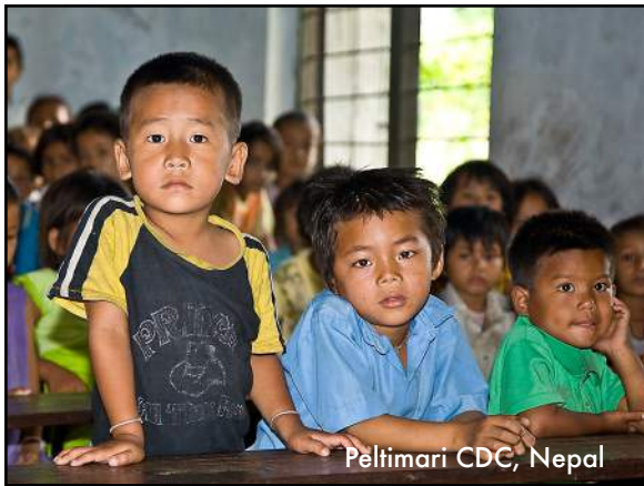
Pellimari CDC, Nepal