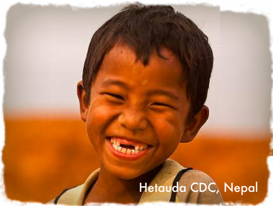
Hetauda CDC, Nepal

COMPASSION 575 -partnering with Nazarene Compassionate Ministries (NCM)-South Asia