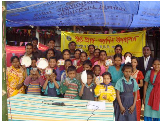
Celebrating Pre-Christmas Program

joy. And of course it's not just one CDC celebrating Christmas but the entire village joins them in their celebrations.