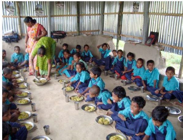
CDC Children are having nutritious food

75% of children below the age of 12 years are malnourished in our country. The CDC center is providing one nutritionally balanced meal (Hotch potch) to the children for 6 days per week. The nutritionist approved the ingredients for the meals (Rice, Lentil, local vegetable, spices with oil, egg, fish, and meat). As we know a hungry child cannot concentrate on studies and a hungry child cannot perform well in the class or any kind of activities. When the children are having this nutritional food most of them are gaining weights and looks better in terms of physical condition. CDC center also providing forums to demonstrate active feeding and healing opportunities for severely malnourished children.