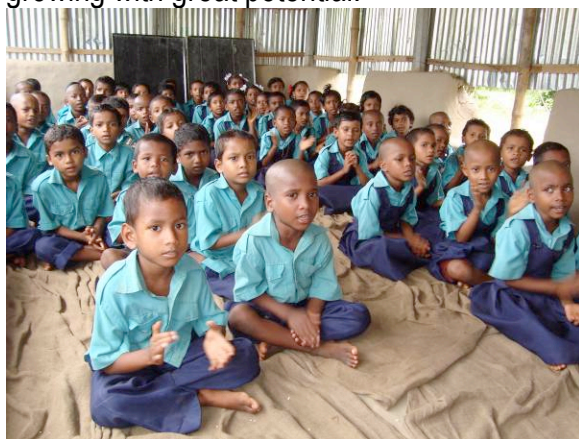
Children are singing song

The religious development of a child of course begins first and foremost at home, than at school. The CDC center also focused on children's spiritual growth. Children from the beginning learn to follow a life of religious by observing rituals, listening to stories and plays. Classical performing arts like dance and music also teach the beauty of living a life in accordance with religion. The CDC center taught the children through stories, song and drama. Humility and ability to respect are often taught through stories. Other important and universal values like telling the truth, non-stealing, non-violence are conveyed easily through stories with a moral. So the Children in the center are growing with great potential.