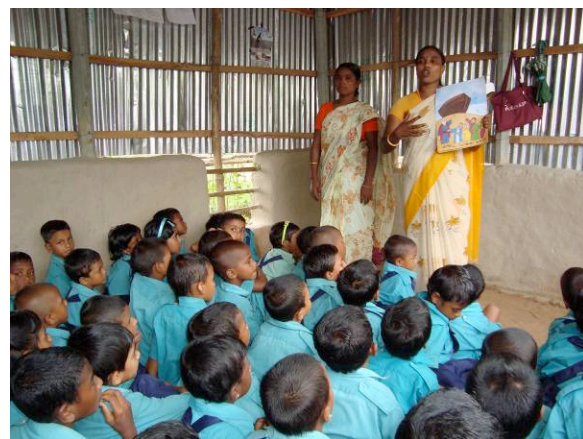
Children are listening story of Noah

The CDC Center also arrange awareness training about safe drinking water, sanitation, health, nutrition, food, agriculture, kitchen garden for the mother of the children. There are self-help group in each center. The CDC children's mothers are the members of the group. Through the self help