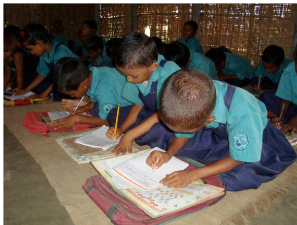
Children of Vatpara CDC is doing class work

The CDC centers ensure formal schooling and special coaching program for the children. Our goal is to help children successfully complete their education and attain their full potential by working with teachers and communities so that they can create "child friendly" classrooms. Government approved curriculum is used to ensure that children are learning what students all around the country are learning. The children was sat for the annual exam and written their exam very well. Along with the basic education, they are also taught to learn basic values of human life. We believe that through education the children empower themselves in future.