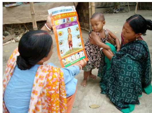
Giving Health teaching to the CDC children mother

Our CDC programs focus on improving household practices and knowledge, distributing de-worming medicines to the children along with their families. The CDC center has also arranged health Check-up. The CDC center has also arranged proper sanitation facilities and safe drinking water for the children.