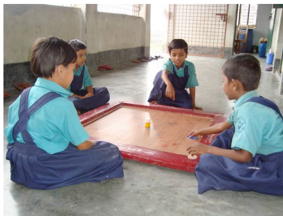
Children are playing together

Early social skill is important in children's overall development as children build a sense of their abilities at a very early age. Some children need a great deal of support learning to develop and sustain social interactions and all children need support at some times. The CDC center involve children in group play, games, visit friends house etc. In doing so, children learn to see things from another point of view, to make compromises and resolve conflicts, and to share, collaborate and negotiate for themselves.