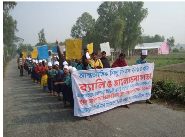
Rally on International Children's Day