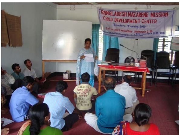
CDC program officer teaching a session

The teachers of the CDCs attended a teachers' training on November 22–25, 2010. There the teachers learned about the Code of Conduct for Child Development Workers, rules and correspondence, how to create a safe environment for the children, how to form SHGs, about health and nutrition, games and songs. These trainings helped build the capacity of the teachers and encouraged them to work effectively.