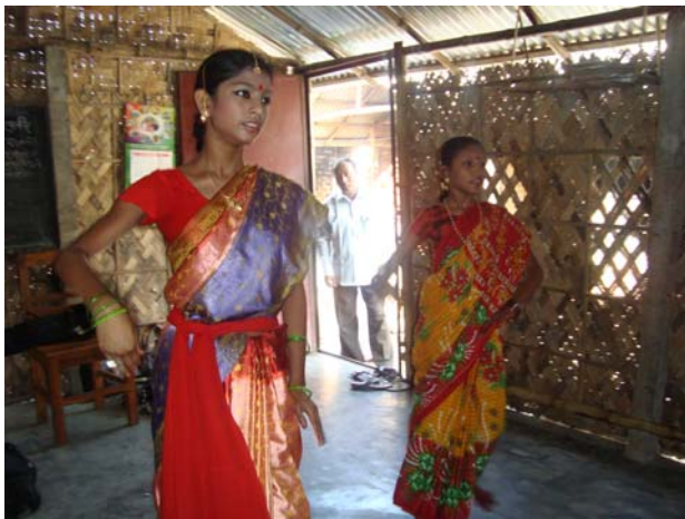
Arifpur children performing a dance in cultural program

CDCs organized a cultural program for the children, where the children presented patriotic songs and poems. Through this the children understood the significance of Victory Day.