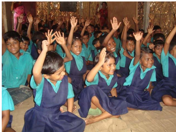
Children in Sunday School