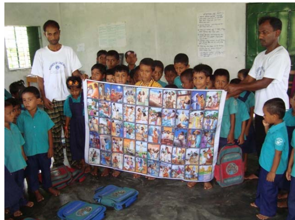
Holdibunia children with Bible Story Cloth