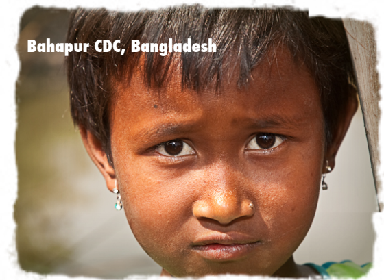
Bahapur CDC, Bangladesh

YOUR INVESTMENT OF $108 WILL SPONSOR ONE CHILD FOR A YEAR. HOW MANY WILL YOU SPONSOR?