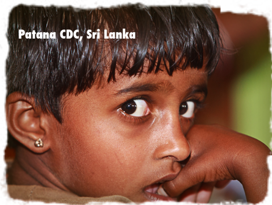
Patana CDC, Sri Lanka

COMPASSION 575 - a fundraiser for the children by NCM -South Asia