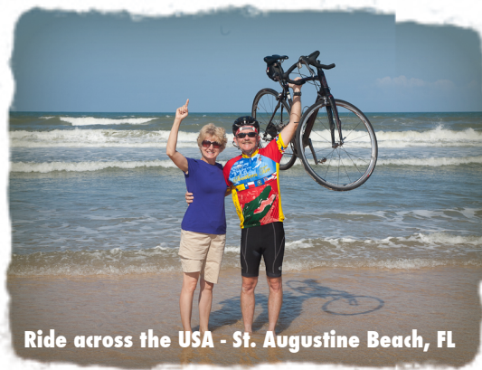
Ride across the USA - St. Augustine Beach, FL

3,000,000 CHILDREN DIE EACH YEAR IN SOUTH ASIA FROM DISEASE AND MALNUTRITION. THAT REPRESENTS A CHILD DYING EVERY 10 SECONDS.