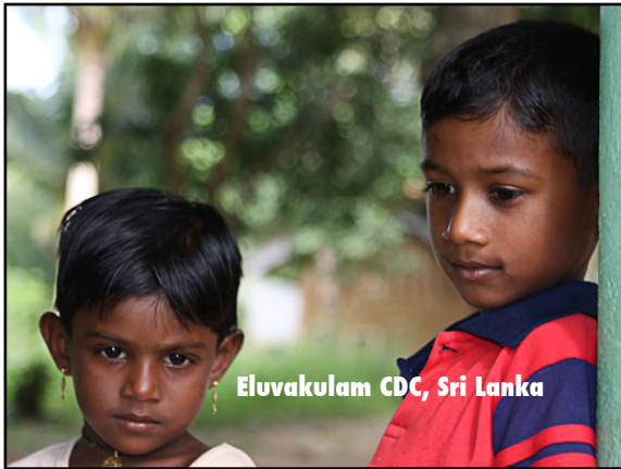
Eluvakulam CDC, Sri Lanka