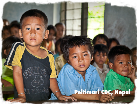
Peltimari CDC, Nepal

COMPASSION 575 - a fundraiser for the children by NCM South Asia