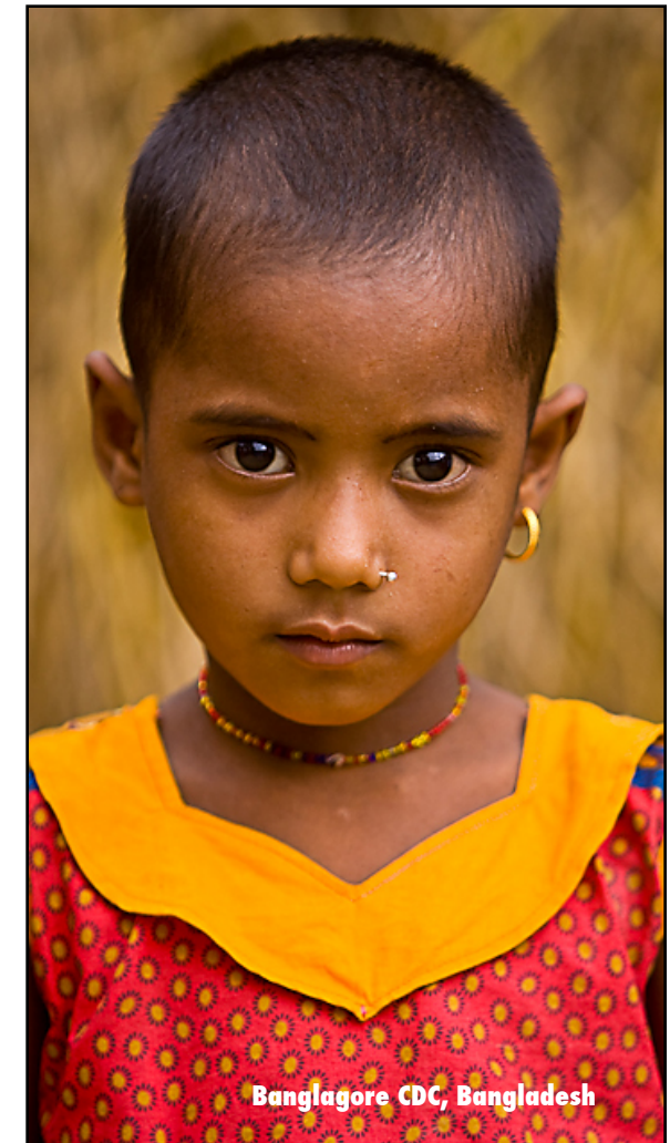
Banglagore CDC, Bangladesh