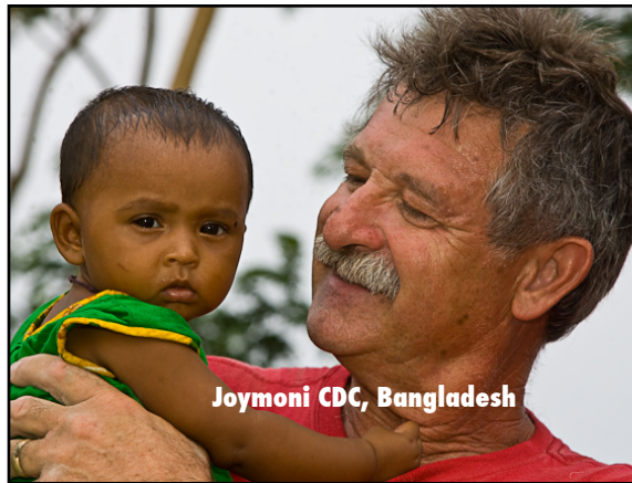
Joymoni CDC, Bangladesh