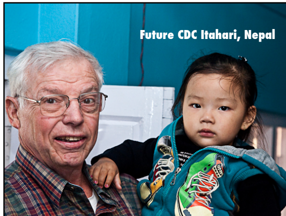
Future CDC Itahari, Nepal