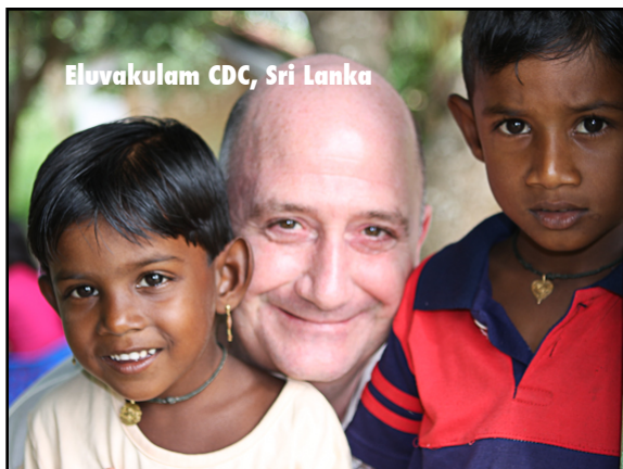
Eluvakulam CDC, Sri Lanka

Please consider giving hope to a child by sponsoring a child for a year in a CDC. The cost is only $9 a month or $108 a year.