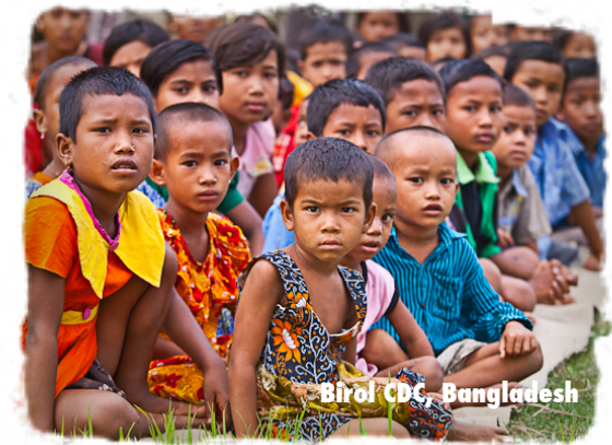
Birol CDC, Bangladesh

3,000,000 CHILDREN DIE EACH YEAR IN SOUTH ASIA FROM DISEASE AND MALNUTRITION. THAT REPRESENTS A CHILD DYING EVERY 10 SECONDS.