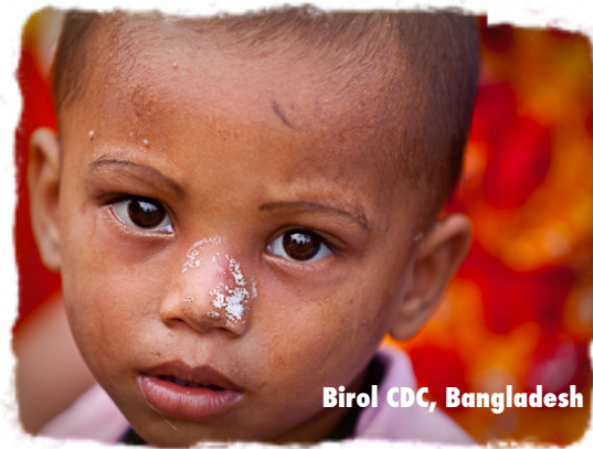
Birol CDC, Bangladesh